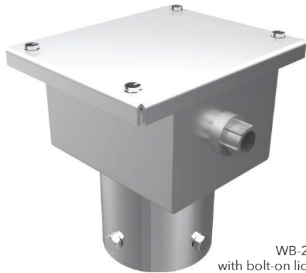
WB-2 with bolt-on lid

Designed as an instrument housing or junction box for electrical, electronic or pneumatic components. Provides protection from wind-driven rain, sleet, snow and dripping water.